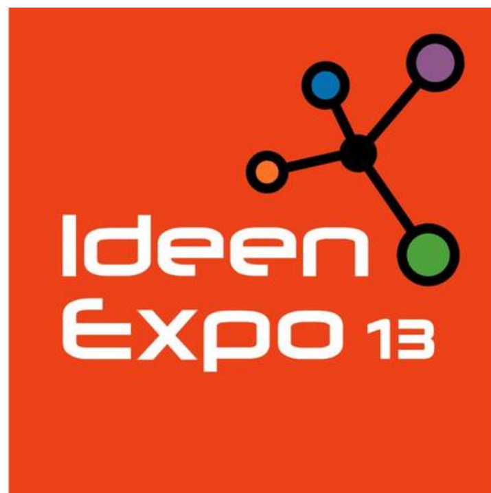
The IdeenExpo 2013 Logo

You can find the LZH press releases with a WORD-download and when possible illustrations at www.lzh.de under "publications/press releases"