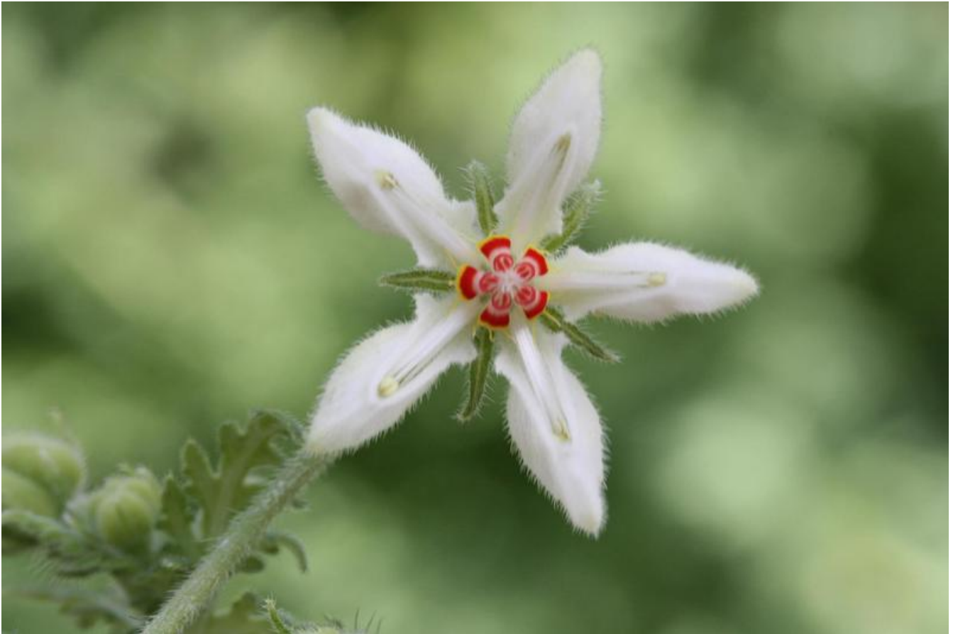
The colourful flower of the rock nettle Blumenbachia insignis in the Botanical Gardens of Bonn University.