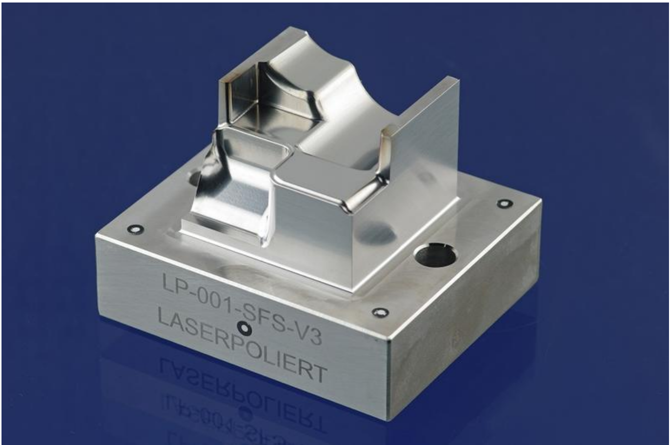
Laser-polished active surface cutout of a slider for die casting.